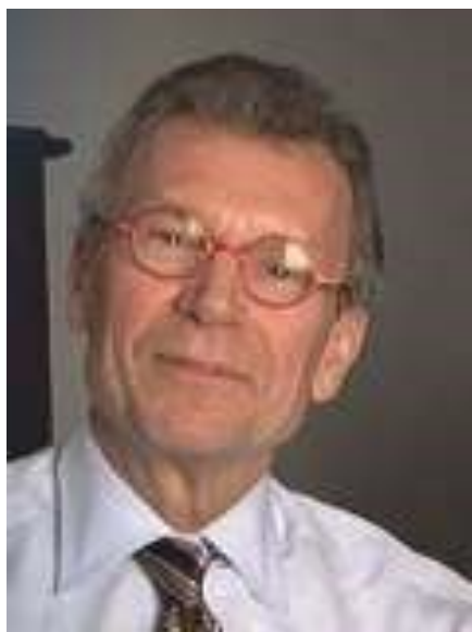
Former Senator Tom Daschle, President Obama's original nominee for the head of the Department of Health and Human Services, failed to pay $130,000 in federal taxes on time

IRS data reveals that in 2009 there were 41 employees of the Executive Office of the President that failed to pay a combined $831,055 in taxes. Unfortunately the taxes owed by Congressional staffers make the White House staffers look fiscally responsible. In the year 2009 there were 217 U.S. Senate staffers that owed a combined $ 2,774,836. Similarly in the House of Representatives 421 staffers failed to pay a combined $ 6,524,892. If you or I were so reckless and irresponsible there would be consequences. Those whose job it is to create our nation's laws and policies should be expected to abide by them.