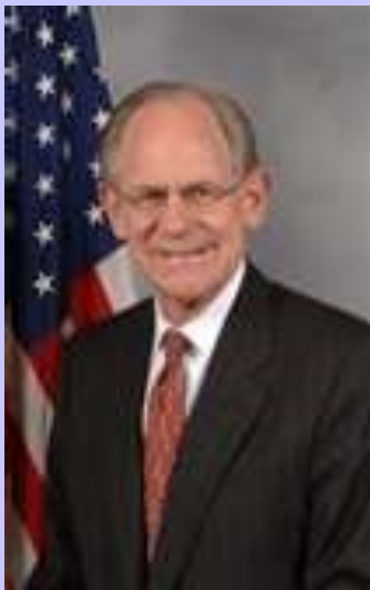
Delaware Congressman Mike Castle lost in a surprising upset to conservative Christine O'Donnell,

The United States of America is in the midst of a national debate over the size and scope of government and there is reason to be hopeful. Recent primary victories by conservatives Joe Miller in Alaska and Christine O'Donnell in Delaware should have Americans feeling optimistic about the prospects of real change coming to Washington in 2011. Miller and O'Donnell's triumphs over entrenched incumbents Lisa Murkowski and Mike Castle are just the latest jolt to an establishment that has paved the way for 10 percent unemployment, an unsustainable $13.3 trillion national debt, and record budget deficits.