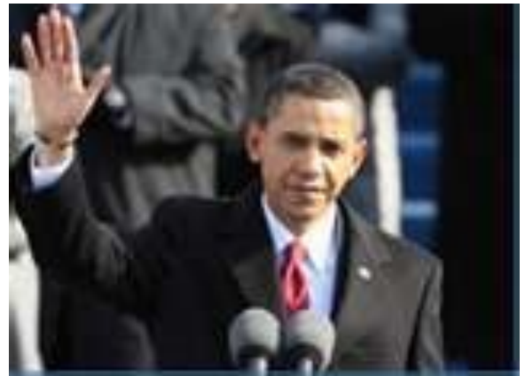
President Obama does not appear to be backing his former statement on NBC that taxes shouldn't be raised in a recession

And in a time of economic crisis President Ronald Reagan had the wherewithal to cut taxes to lead our nation out of a recession. In August of 2009 President Obama seemed to understand this, when speaking with NBC, he proclaimed "you don't raise taxes in a recession."