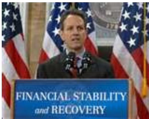
President Obama's Secretary of Treasury pick Timothy Geithner found himself on the long list of delinquent taxpayers as well

The list of Obama appointees with tax irregularities is pretty extensive. It even includes Timothy Geithner, Obama's Treasury Secretary, who had to pay $34,000 in back taxes.