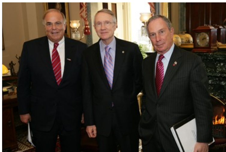
Pennsylvania Governor Ed Rendell with New York Mayor Michael Bloomberg and Senate Majority Leader Harry Reid

Even with these hurdles, most of the evidence indicates Republicans will see gains at the state level. This will be a challenge to Obama if he seeks re-election in 2012. Without the benefit of Democratic governors in big states out campaigning for him (like Governor Ed Rendell did in Pennsylvania) Obama will have a harder time winning the states he won last time.