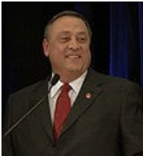
Republican Paul LePage will be the next governor of Maine. Le Page took over for Democrat John Baldacci, showing how the Republican tide is gaining strength in New England.

Even New England, long a bastion of liberal Democratic stalwarts, moved Republican. Maine elected a Republican governor, state senate, and state house.