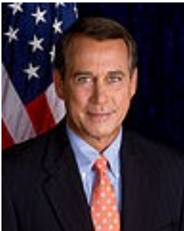
Rep. John Boehner (R-OH), an opponent of the Obama health-care bill, will become the Speaker of the House in January 2011 and change the direction of the U.S. House

Learn from this legislative debacle. Support efforts to place every bill online for at least 3 days before voting on it.