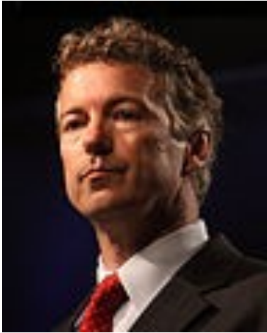
Rand Paul (R-KY) won a coveted seat in the formerly Democrat-dominated Senate against Jack Conway in the November 2, 2010 midterm elections

On November 2 nd , conservatives were ecstatic that control of the House of Representatives was taken away from liberal Speaker Nancy Pelosi (D-CA). That election brought in over 60 new Republicans (with some close races still to be decided as of this writing). Conservatives are hopeful these new Republicans will drive a stake through the heart of the Obama Administration's leftwing agenda. Conservatives also saw gains in the Senate, with Rand Paul (R-KY) and Marco Rubio (R-FL) being among some of the more conservative members elected that night.