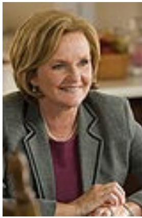
Jim Webb (D-VA) and Claire McCaskill (D-MO) are two of the Senate seats most vulnerable in 2012

There is no doubt that anyone who joins the effort to move on these unpopular items on the Democrat wish list would be remembered by the voters in two years and appropriately punished. Meanwhile, across the U.S. Capitol Building in the lower chamber, although more than 60 House Democrats just lost their seats, at least two dozen more members had their political lives flash before their eyes in very close races. These Democrats know who they are and would be wise to stop Nancy Pelosi's lame duck charge before it starts.