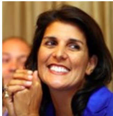
Nikki Haley will be the governor of South Carolina, the first woman to ever hold the position

become the junior U.S. Senator from New Hampshire.