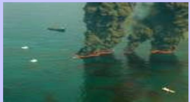
Part of the oil spill devastation on May 19, 2010

Now fast forward to 2010. Is the BP oil spill currently destroying the Gulf of Mexico President Obama's fault? Of course not. Is his administration's response to the spill fair play for criticism? Based on the Democrats' own precedent, it certainly is.