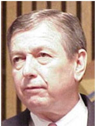
Former Attorney General John Ashcroft was labeled "too conservative" by liberals

Notably, Bush's pick for Attorney General, John Ashcroft, was a nominee singled out by liberals and in the media for being "too conservative." The Ashcroft nomination was held up as an example of just how "out of touch" Bush was with the American people. By contrast, President Obama's more radical appointments are generally passed over by the liberal media, with only the alternative conservative news outlets highlighting them.